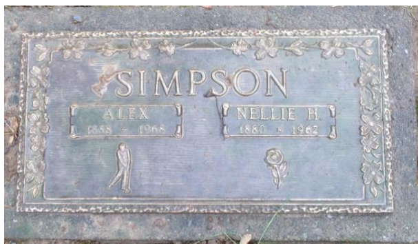
Memorial Tablet Poughkeepsie cemetery, for some reason his birth year is wrong.