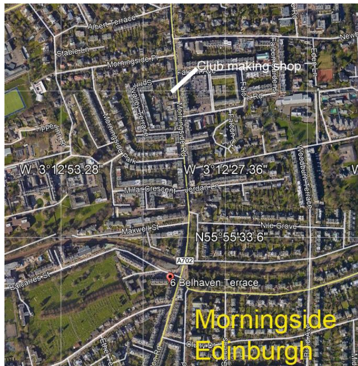
6 Belhaven Terrace